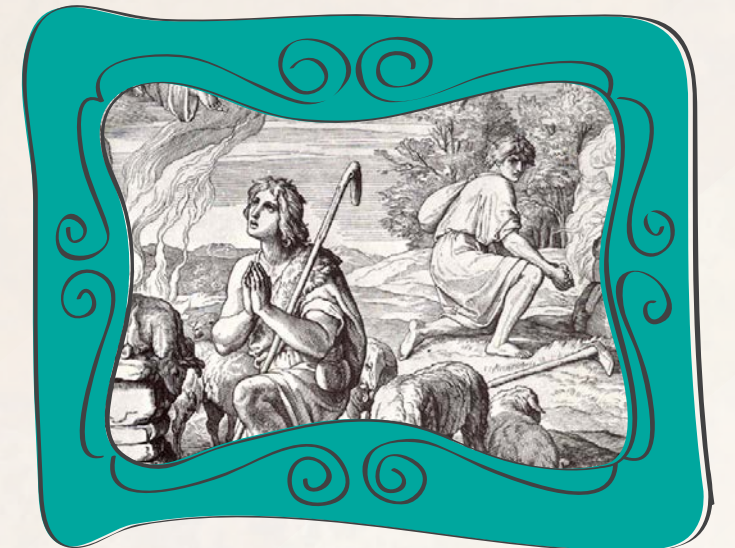
Cain & Abel

First sons of Adam and Eve. Both gave an offering to God; God had regard for Abel's offering but not for Cain's. So Cain killed Abel.